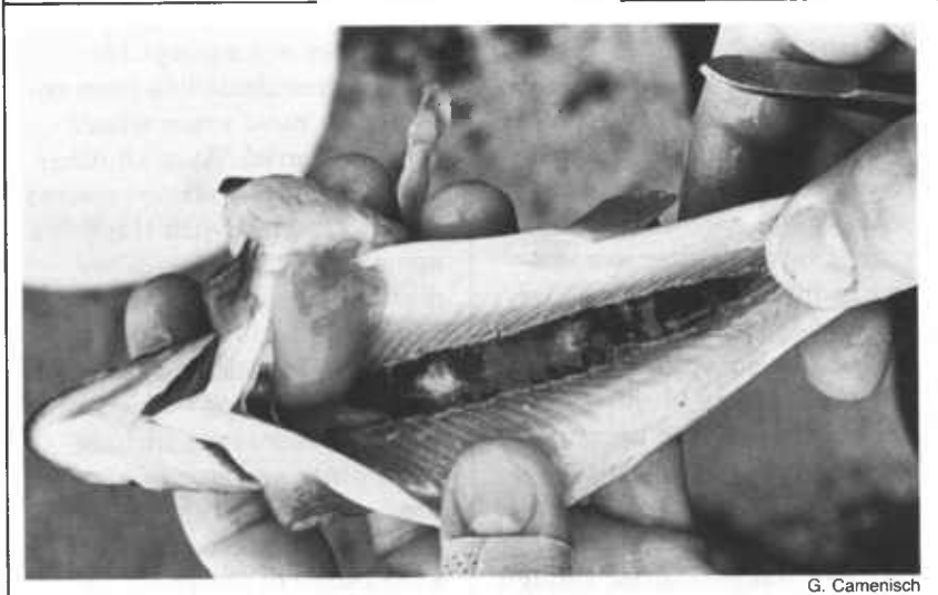
White spots in the kidney of a rainbow trout may be a sign of infection by Bacterial Kidney Disease (BKD).

ERM occurs primarily at temperatures above 50° F (10° C) and is transmitted through the water by diseased and carrier fish. The disease can be prevented by immunization and controlled by improved management. Treatment with sulfonamides and tetracycline has been found effective.